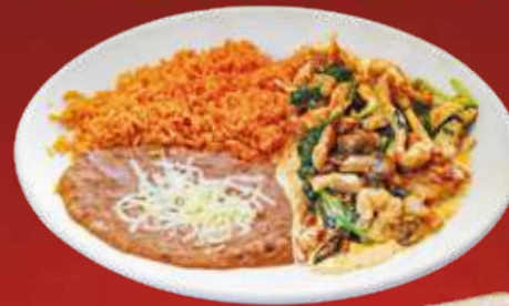
Pollo con Crema