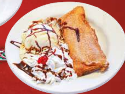
Cheese Cake Chimichanga