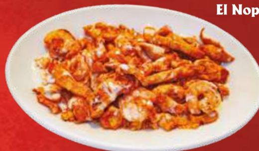
El Nopal Special