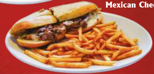
Mexican Cheese Steak