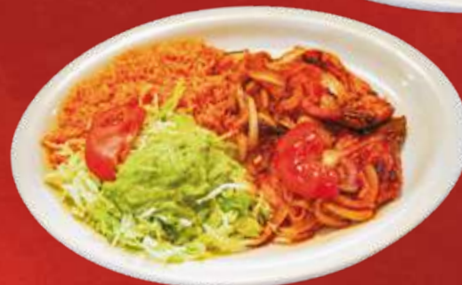
Grilled Pork Chops