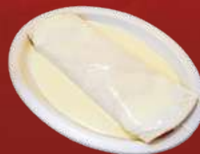
Johnny's Big Burrito