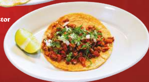
Tacos al Pastor