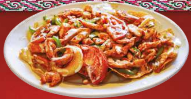
Chicken Fajita Nachos